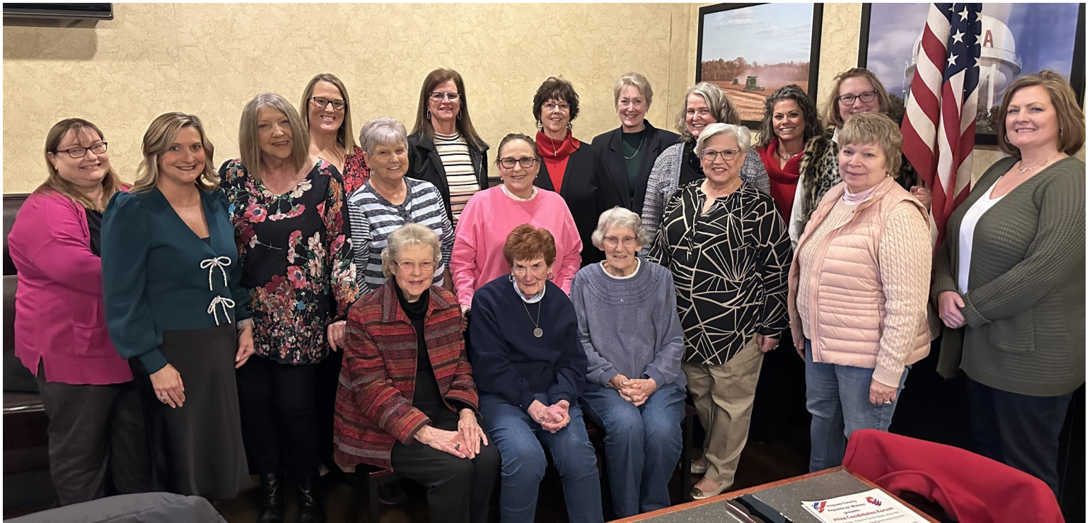
Iroquois County Republican Women

Members of Iroquois County Republican start the 2024 year 18 women strong! With Women We Will Win!