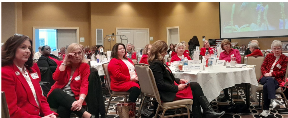
IFRW Club Presidents and Proxies