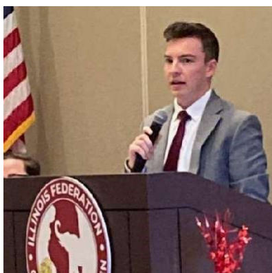
"Trailblazing for the Future". Illinois Young Republicans shared their experiences as party activists on their college campuses.