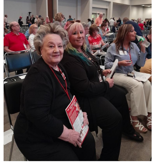
Several IFRW members throughout the state represented their counties as Republican Convention Delegates!