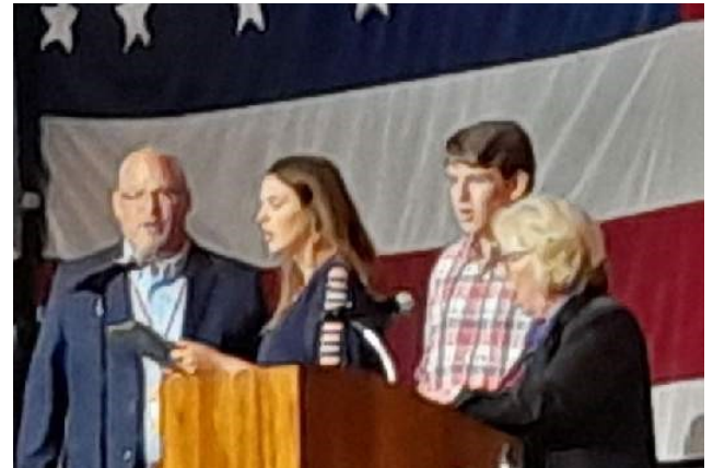
There was a record turnout for the 2024 Illinois Republican Convention with many first time delegates casting their votes.