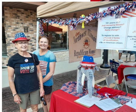
Voter Registration Area