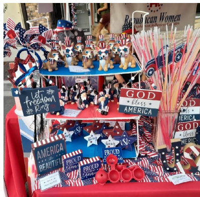
Variety of Patriotic Merchandise